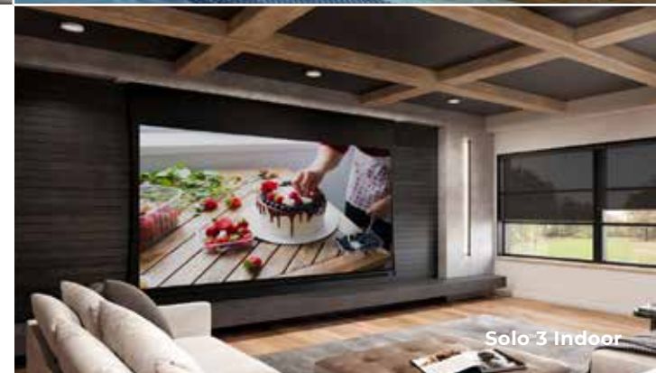
Solo 3 Indoor