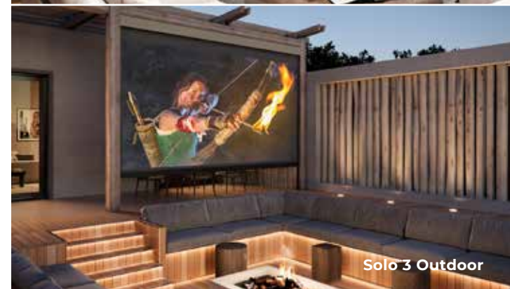
Solo 3 Outdoor