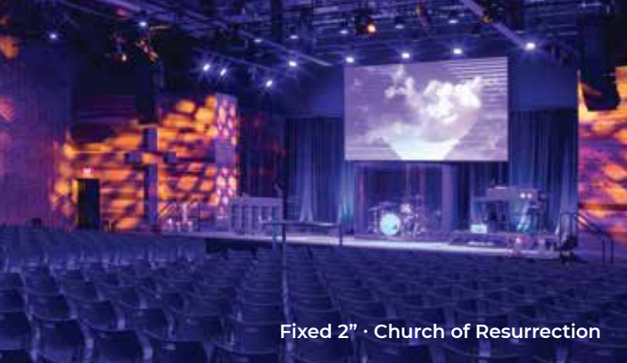
Fixed 2" · Church of Resurrection