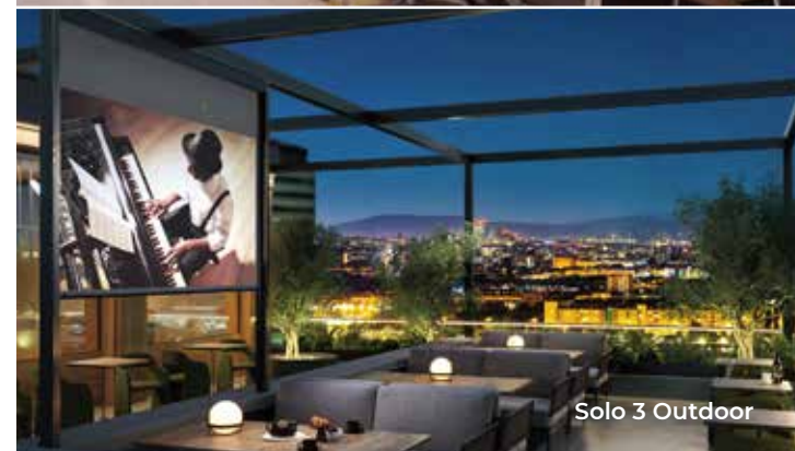
Solo 3 Outdoor