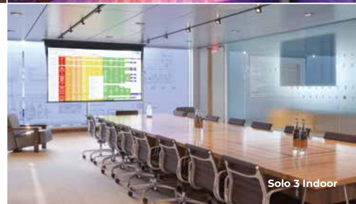
Solo 3 Indoor