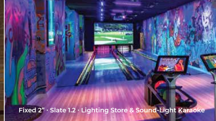
Fixed 2" · Slate 1.2 · Lighting Store & Sound-Light Karaoke