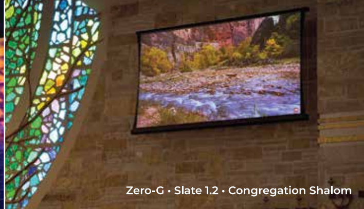
Zero-G · Slate 1.2 · Congregation Shalom